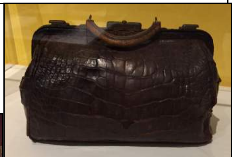
Susan B. Anthony's Alligator Purse, date unknown

National Susan B. Anthony Museum & House