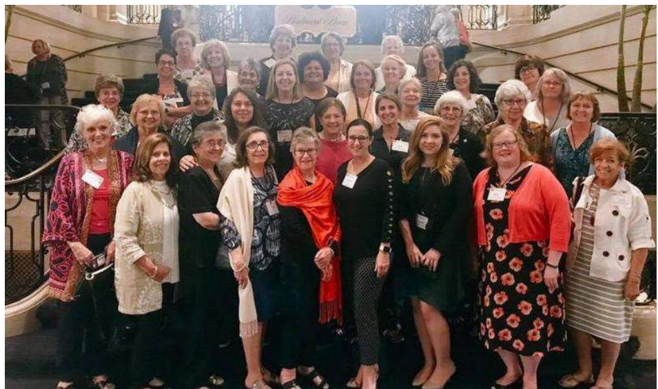
LWNYS delegates at the LWWUS Convention